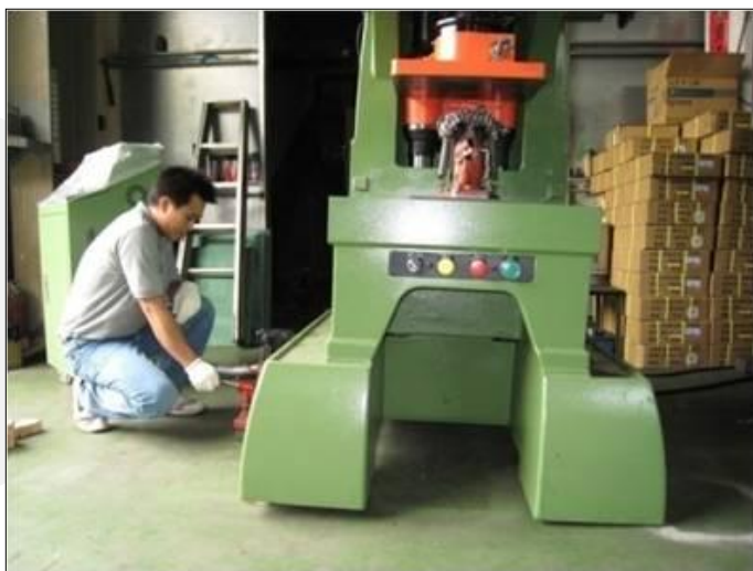
圖2)使用爪式千斤頂緩慢將設備頂起。 Fig 2) Elevate the equipment with claw jack gradually.