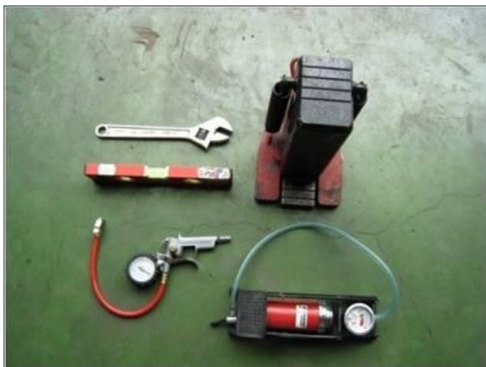
圖1)需要工具：爪式千斤頂、水平尺、扳手、壓力錶、打氣筒。 Fig 1) Required tools: claw jack, level bar, open wrench, pressure gauge, and air pump.