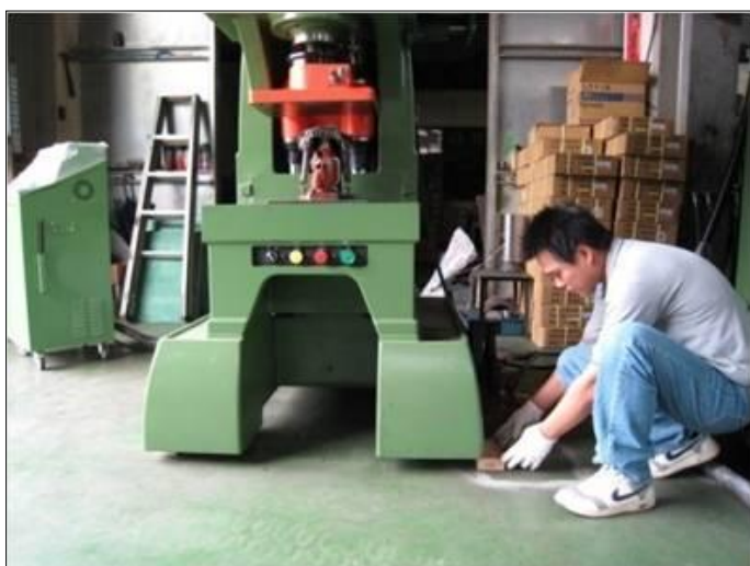
圖3)放置臨時木台110~120mm高度。 Fig 3) Place the wooden panel to 110~120mm.