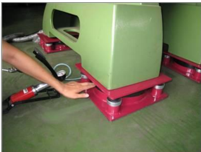
Fig 5) Inflate with air pump. Maximum inner pressure is 4.5\text{kg}/\text{cm}^2 = 0.44\text{Mpa} and the height of maximum loading is 120mm. Take out wooden panel after inflation.

圖5)使用打氣筒打氣至避震器，最大使用內壓為 4.5\text{kg}/\text{cm}^2 = 0.44\text{Mpa} ；最大荷重時標準高度為120mm此時充氣完成後，即可取出臨時木台。